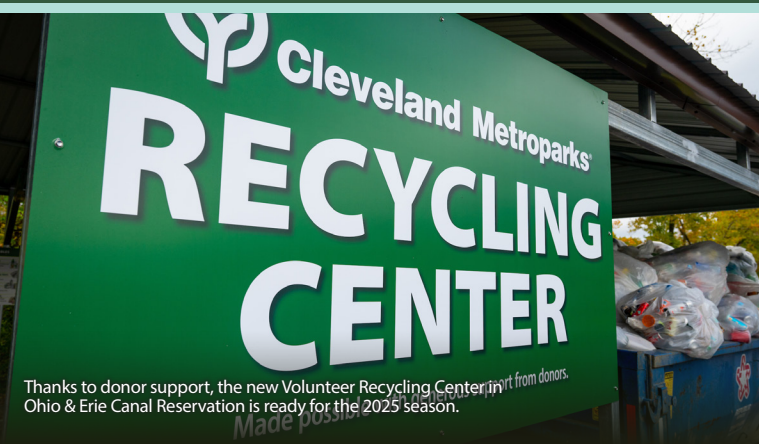
Thanks to donor support, the new Volunteer Recycling Center, in part from donors. Ohio & Erie Canal Reservation is ready for the 2025 season.

Every hour volunteers give, every project they take on, and every smile they share helps shape Cleveland Metroparks into the thriving, welcoming place it is today. We thank our volunteers for their dedication - we are excited to see what we accomplish together in 2025!