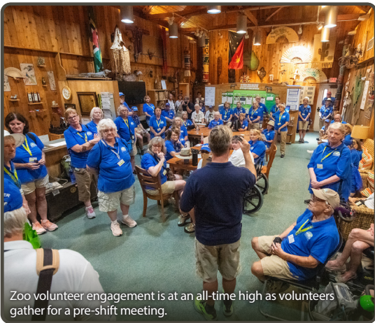
Zoo volunteer engagement is at an all-time high as volunteers gather for a pre-shift meeting.