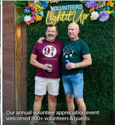
Our annual volunteer appreciation event welcomed 800+ volunteers & guests.

2024 was a tremendous year for Cleveland Metroparks thanks to the collective impact of our volunteers. A total of 1,596 ongoing volunteers donated 107,634 hours across the Emerald Necklace, making a lasting impact on our parks, golf courses and Zoo. And over 5,508 group and episodic volunteers gave an additional 27,648 hours, furthering our mission and strengthening our communities.