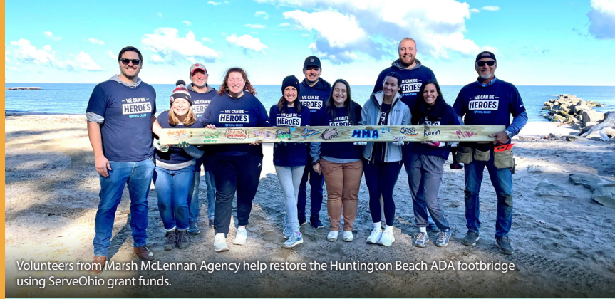
Volunteers from Marsh McLennan Agency help restore the Huntington Beach ADA footbridge using ServeOhio grant funds.