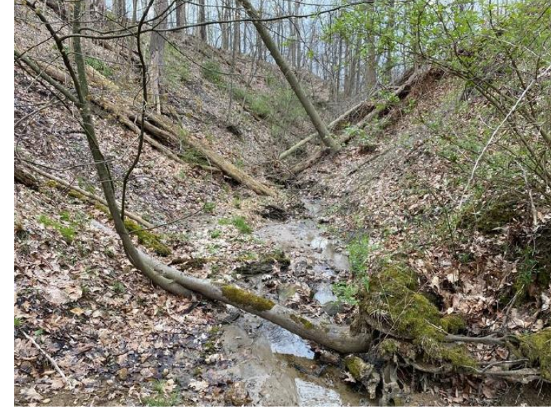
Existing Tributary/ Restoration Area