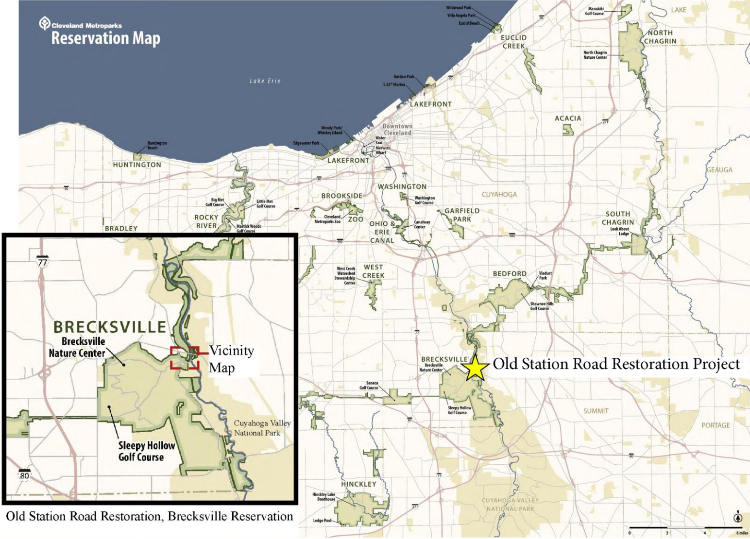
Old Station Road Restoration, Brecksville Reservation