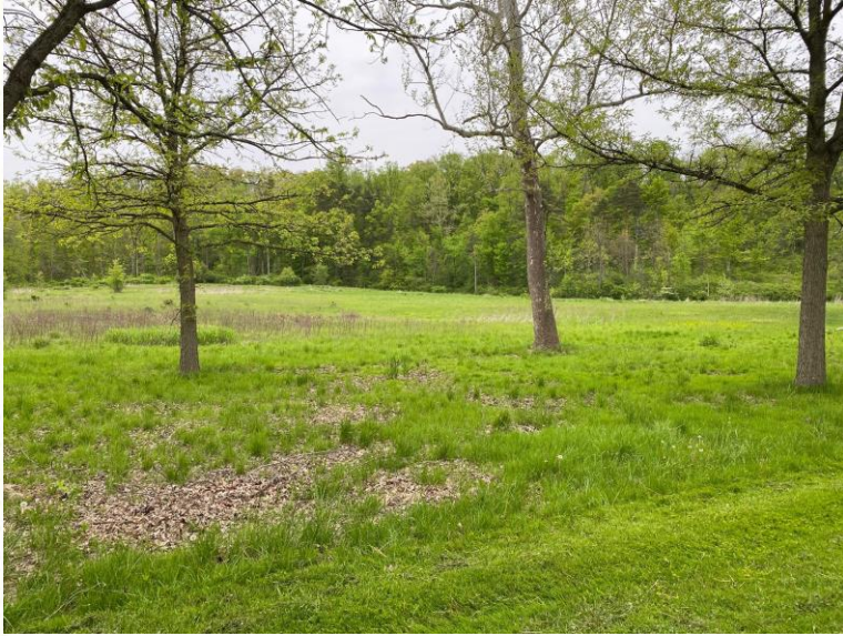
Existing field/ Wetland Enhancement Area