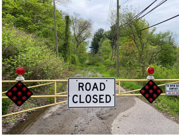
Existing Station Road/ Restoration Area