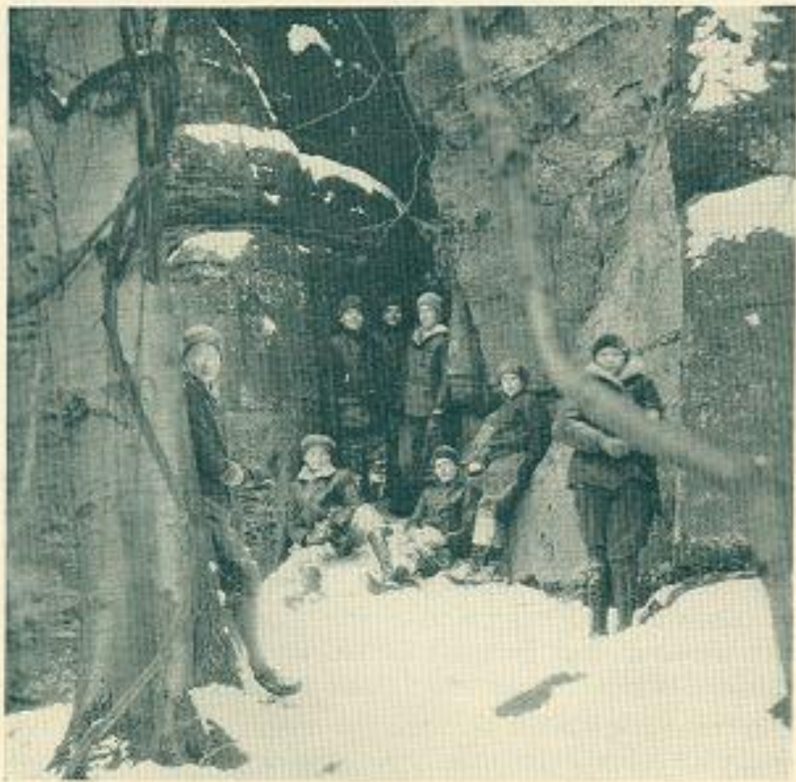
Boy Scouts on a winter hike up among the Hinsckley Ledges