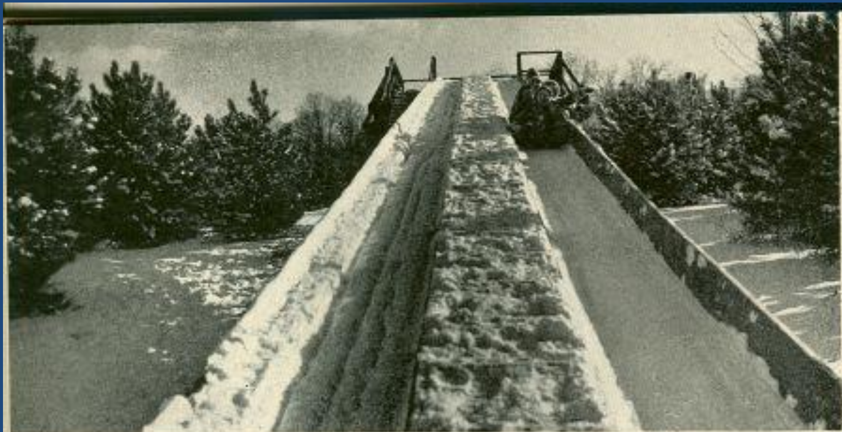
"Let her go" at South Chagrin toboggan course