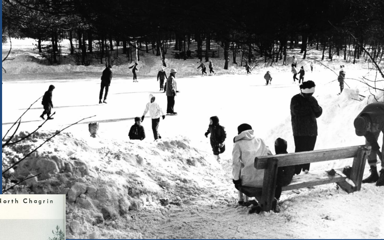
Skating on Strawberry Lane Pond in the North Chagrin Reservation.