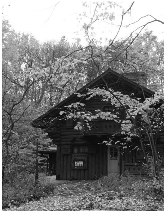
High Priority Resource Example: Look About Lodge, South Chagrin Reservation (Cleveland Metroparks)

The plan preparers classified most of the inventoried resources as Medium and Low Priority resources. The preparers largely reserved High Priority designation for resources considered to be key features of reservations, such as particularly fine examples of WPA-constructed buildings and structures, resources listed in the National Register of Historic Places, and resources that represent important people or events related to the Metroparks (such as the Harriet Keeler Memorial). In general, cultural and historical resources are currently well-managed within the park system. The plan preparers found few areas where improvement could be identified, and no practices appeared to be of pressing need of adjustment in terms of impacting cultural resources. Perhaps the most important thing that park managers can do is to continue to raise awareness of the importance of the stewardship of historical and cultural resources among both park staff and park visitors.