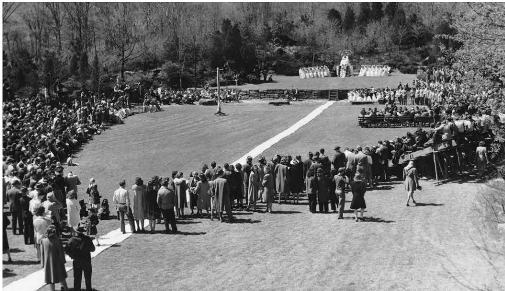
May Day at Music Mound, 1944 (Cleveland Metroparks)

This document is a reference and guidance for park staff going forward into the second century of existence for Cleveland Metroparks. The Plan is meant to serve as both a reference document and as planning guidance, and includes a brief history of Cleveland Metroparks, an explanation of the categorization system used to inventory and classify historical and cultural resources in the park system, individual reservation overviews with historical discussions and summaries of historic resource inventories, and guidance on plan implementation.