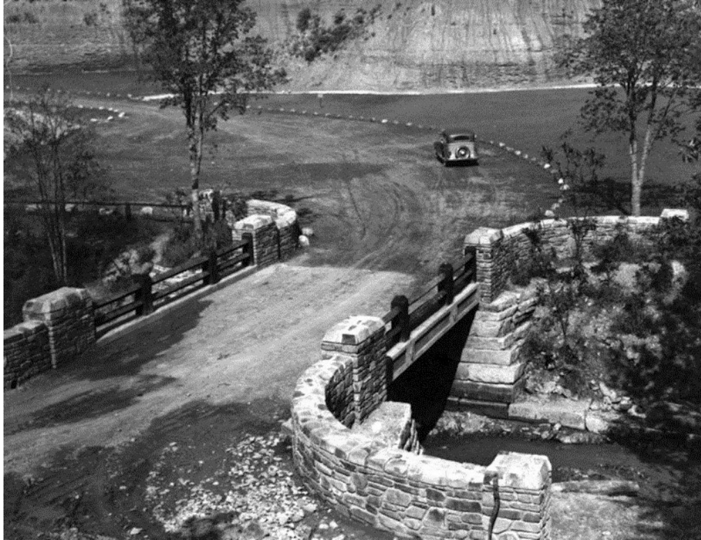
Quarry Picnic Area Bridge built by CCC, Euclid Creek Reservation 1935

Four reservations have less than 10 known resources (Big Creek, Bradley Woods, Ohio & Erie Canal, and Washington), while Brookside Reservation/Cleveland Metroparks Zoo, Euclid Creek, Garfield Park, and Lakefront each have between 10 and 20 known resources. While it may seem that cultural resources are more common at the largest parks, known resources occur at about the same frequency across all reservations, no matter the size of the park. Rocky River, with 2,572 acres and 48 resources, has the same frequency of occurrence as Washington Reservation, with 278 acres and two resources: less than 1 resource per acre of park property.