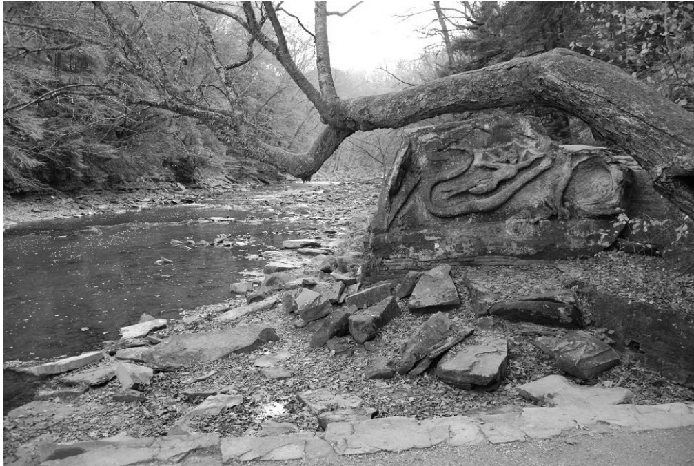
Chagrin State Scenic River and Henry Church Rock, South Chagrin Reservation

cited in the document. In addition to the Plan, Lawhon & Associates created and submitted a cultural resources Geographic Information Systems (GIS) geodatabase containing the locations of every resource inventoried in the plan, along with all the information presented in the resource inventory tables in the appendices. The geodatabase is integrated into the existing Cleveland Metroparks GIS and used in planning future park improvements.