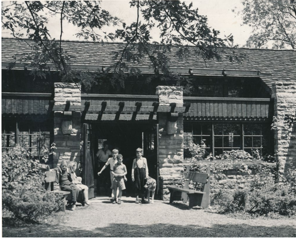
Brecksville Reservation Trailside Museum (now Brecksville Nature Center), 1940s

Historical structures include such things as bridges and stone walls and are especially common at reservations where there was WPA/CCC activity. Most, if not all, the stonework structures in the Park District were built with labor supplied by crews working under the CCC, WPA, or other federal relief programs during the Great Depression, including structures found at reservations that were former city parks, like Garfield Park and Edgewater Park. The CCC and WPA crews worked under the direct management of the Park District. Landscape features, cultural landscapes, and objects are all relatively uncommon resources in the Park District, and include natural features, golf courses, historic districts, and memorials.