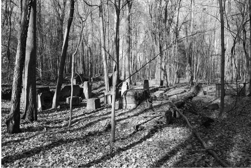
Stone Quarry building ruins, Bradley Woods Reservation

Most of the historical buildings owned or managed by Cleveland Metroparks are park-related, such as picnic shelters. Several of these shelters are excellent examples of the work of CCC and WPA crews in the Park District during the Great Depression. Indeed, two CCC camps were in the Park District, one at Euclid Creek and the other at Brecksville. Crews from these camps would range throughout the parks, building shelters, nature centers, roads, bridges, and retaining walls. These CCC and WPA features of the Park District helped to create a distinctive character common to the original nine reservations, known as the “Legacy Parks”: Bedford, Brecksville, Big Creek, Euclid Creek, Rocky River (including part of modern-day Mill Stream Run), Hinckley, Huntington, North Chagrin, and South Chagrin.